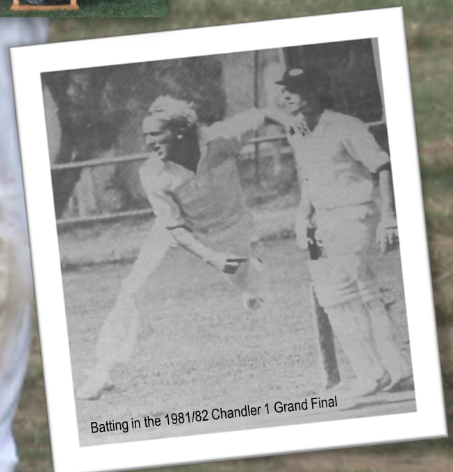
Batting in the 1981/82 Chandler 1 Grand Final