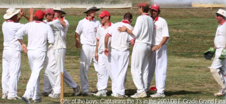
One of the boys: Captaining the 3's in the 2007/08 F-Grade Grand Final