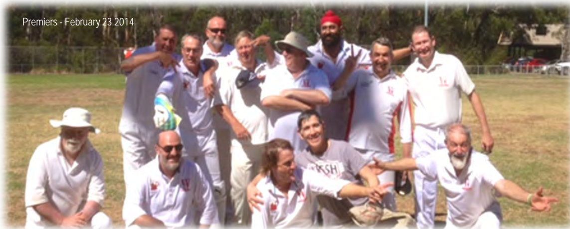
Premiers - February 23 2014