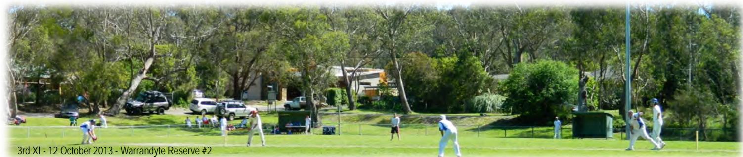
3rd XI - 12 October 2013 - Warrandyte Reserve #2