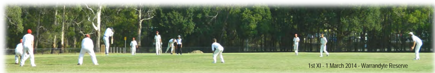
1st XI - 1 March 2014 - Warrandyte Reserve