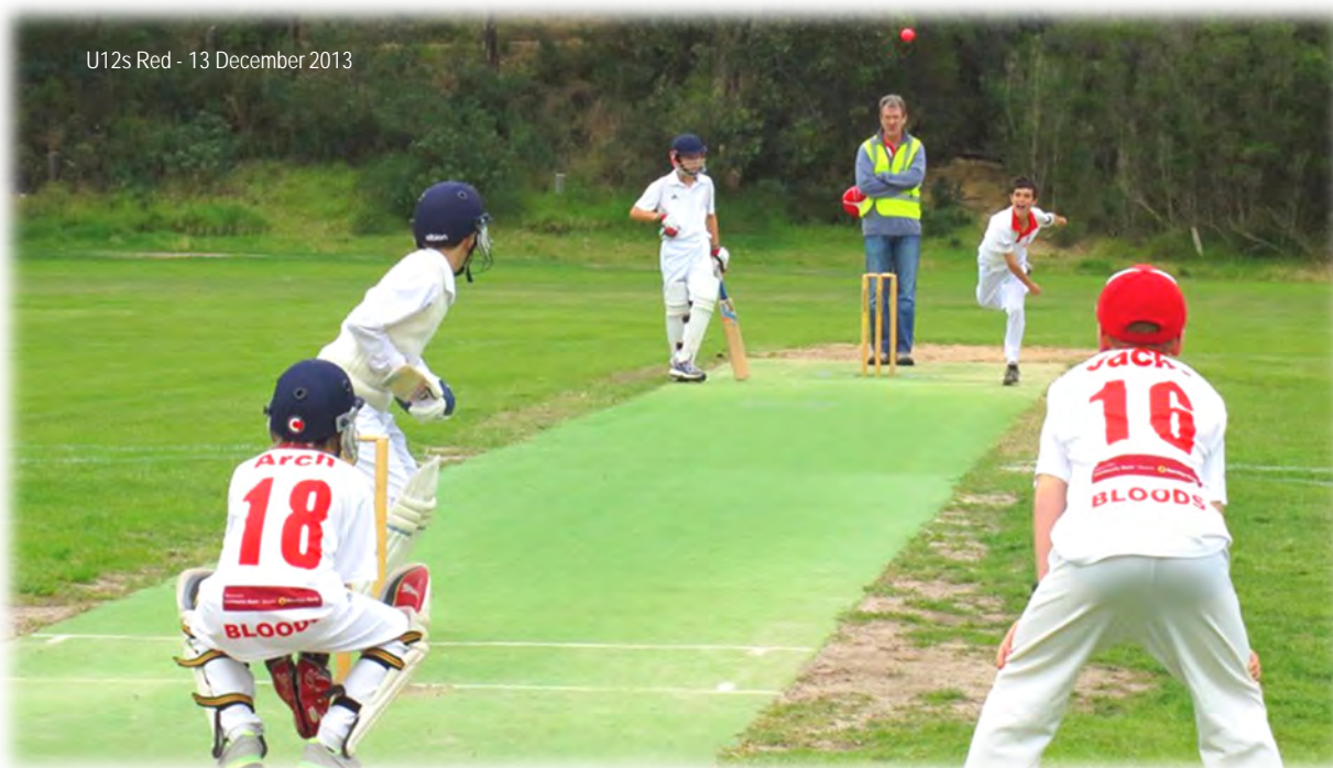
U12s Red - 13 December 2013