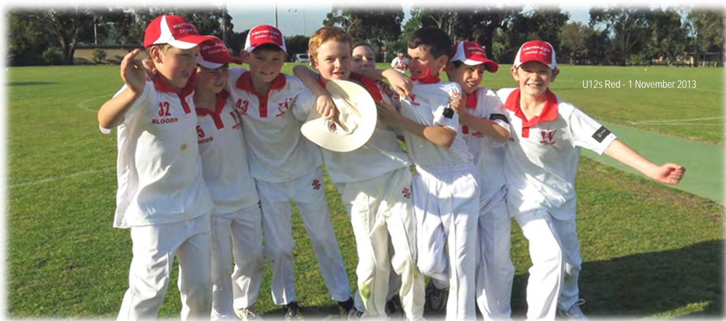
U12s Red - 1 November 2013